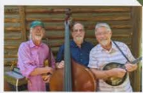
Youngman & Oldmen